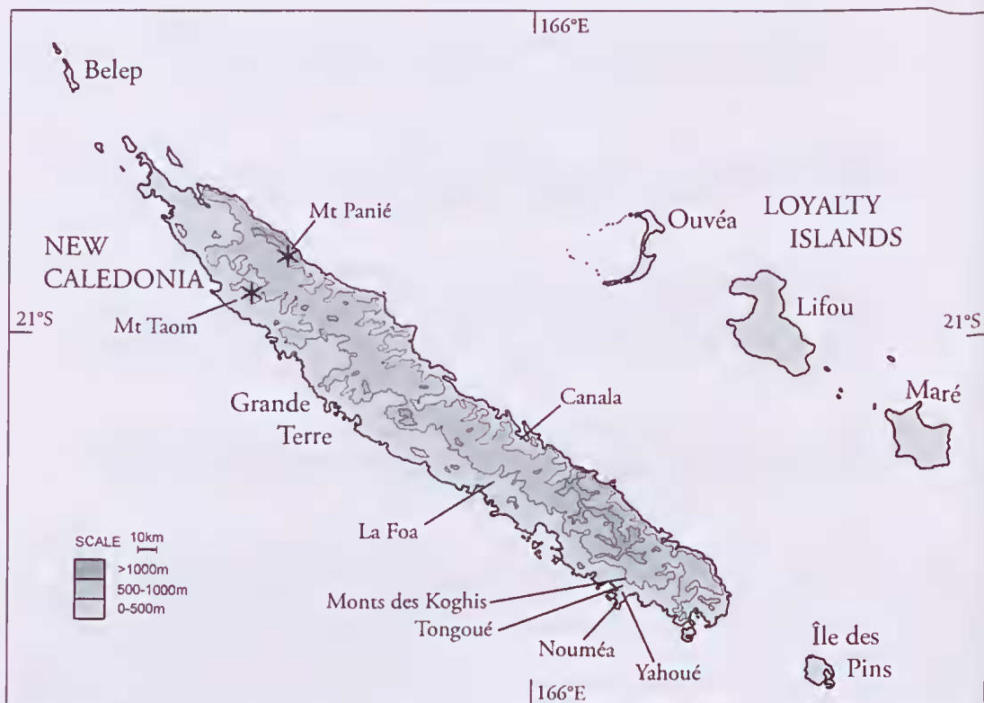
FIG. 1. Map of New Caledonia showing localities for Taomica cassani gen. et sp. nov. (*) and other localities from which pselaphine species have been recorded in the catalogue.

more closely resembles members of the tribe Tyrini. Taomica , due to the strange development of maxillary palpi, the presence of two pairs of long, acute spines on the ventral side of head, and the presence of a single basal fovea on each elytron, is strongly isolated within the tribe and this distinctive genus cannot be placed near any other at this time. Further important generic characters are as follows: frontal fovea absent; two setose foveae on vertex; eyes large; maxillary palpi very characteristic, segment II curved basally and IV extremely large, curved, machete-like; pronotum with minuscule antebasal median and lateral foveae; antebasal sulcus absent; elytron with sutural stria well defined along entire length; tergite III distinctly longer than tergites IV-VIII combined, with two large setose basal depressions.